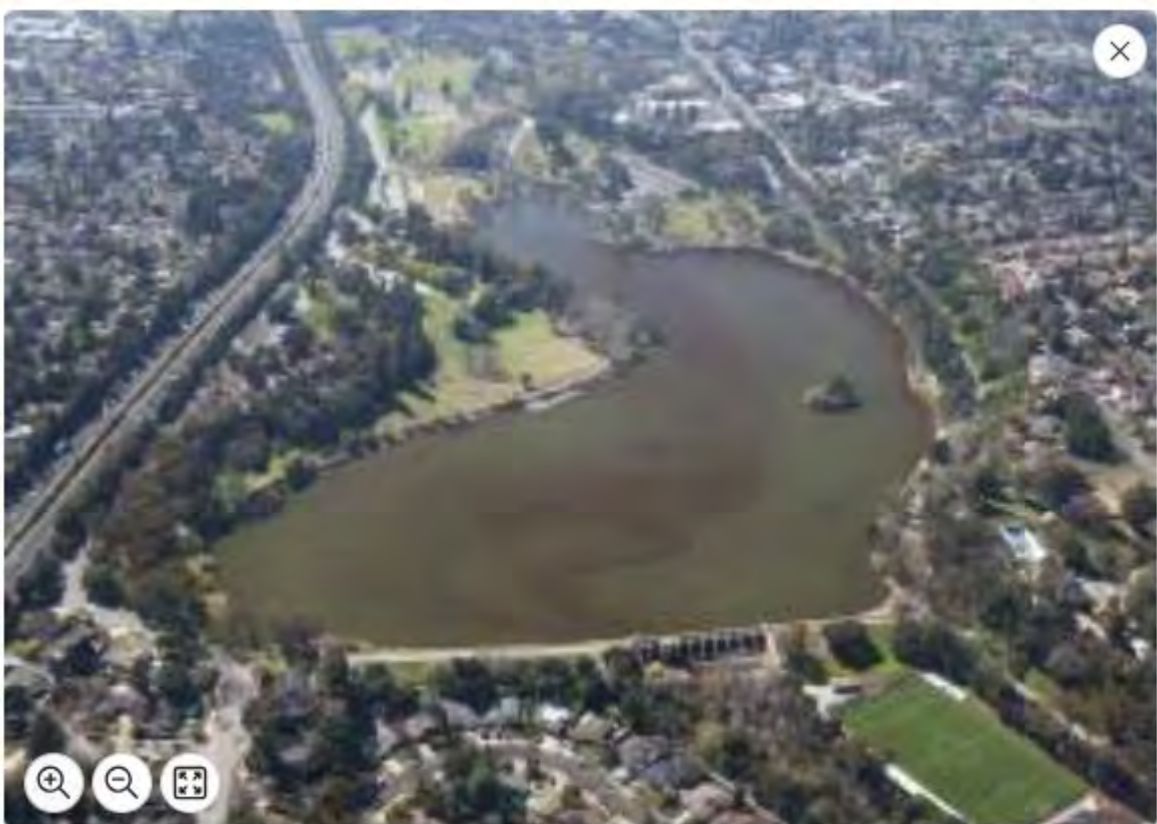
Vasona Dam & Reservoir