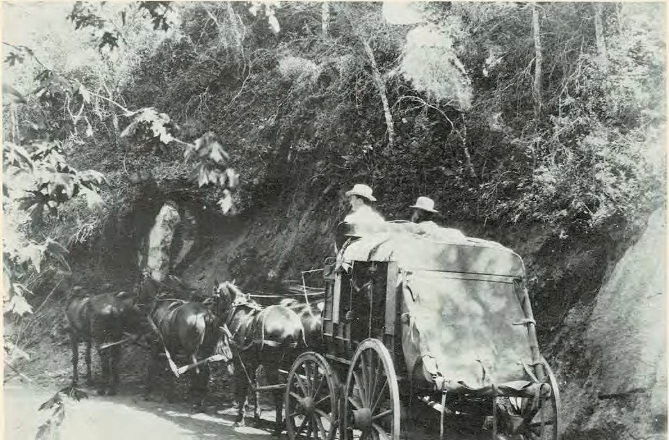
Early transportation over the mountain passes.

The highway runs east out of Sacramento, and continues into the foothills to Placerville. From Placerville it winds through the Sierra and then down the steep escarpment from Echo Summit to South Lake Tahoe. From South Lake Tahoe the road continues to Carson City, then across Nevada and Utah to Salt Lake City.