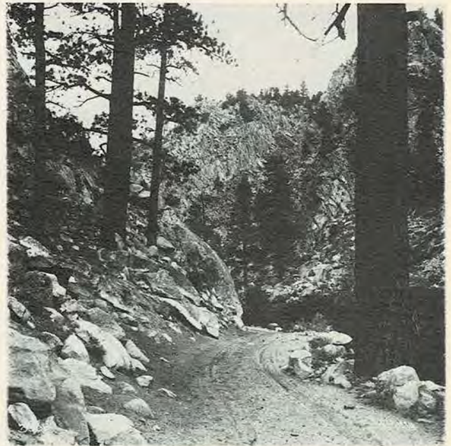
Forerunner to the modern highway of today.

In 1901 the legislature made that portion of the Sonora and Mono Toll Road between Long Barn and Bridgeport a state highway, (now State Route 108), but appropriated no funds for its maintenance or improvements. The report of the Department of Highways states: "The 61 miles of this road from Long Barn to the junction was, in July 1901, in a very bad state of repair; the 22 miles over granite formation was nothing more than a creekbed, while all bridges on the route were either in rotten condition or else fallen down."