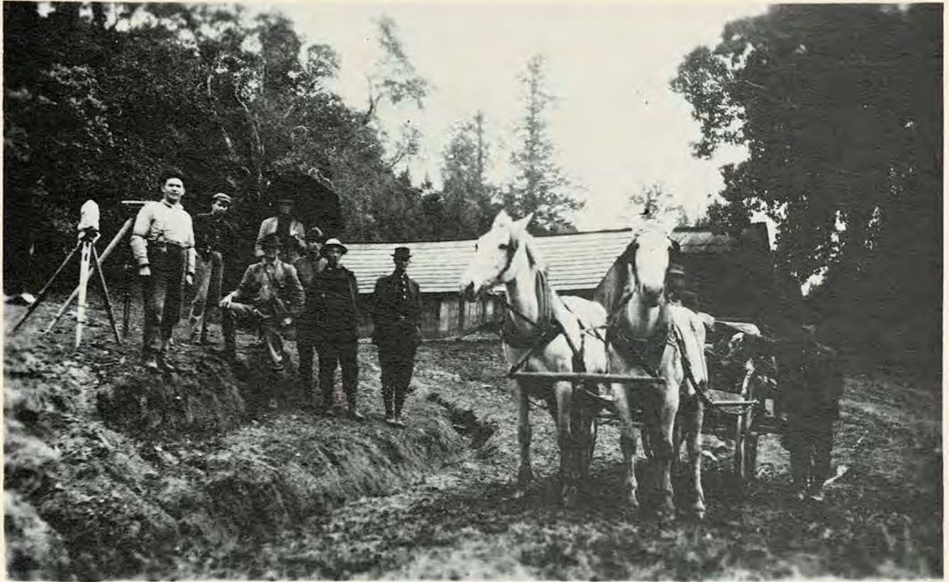
A pioneer surveying and route location crew.