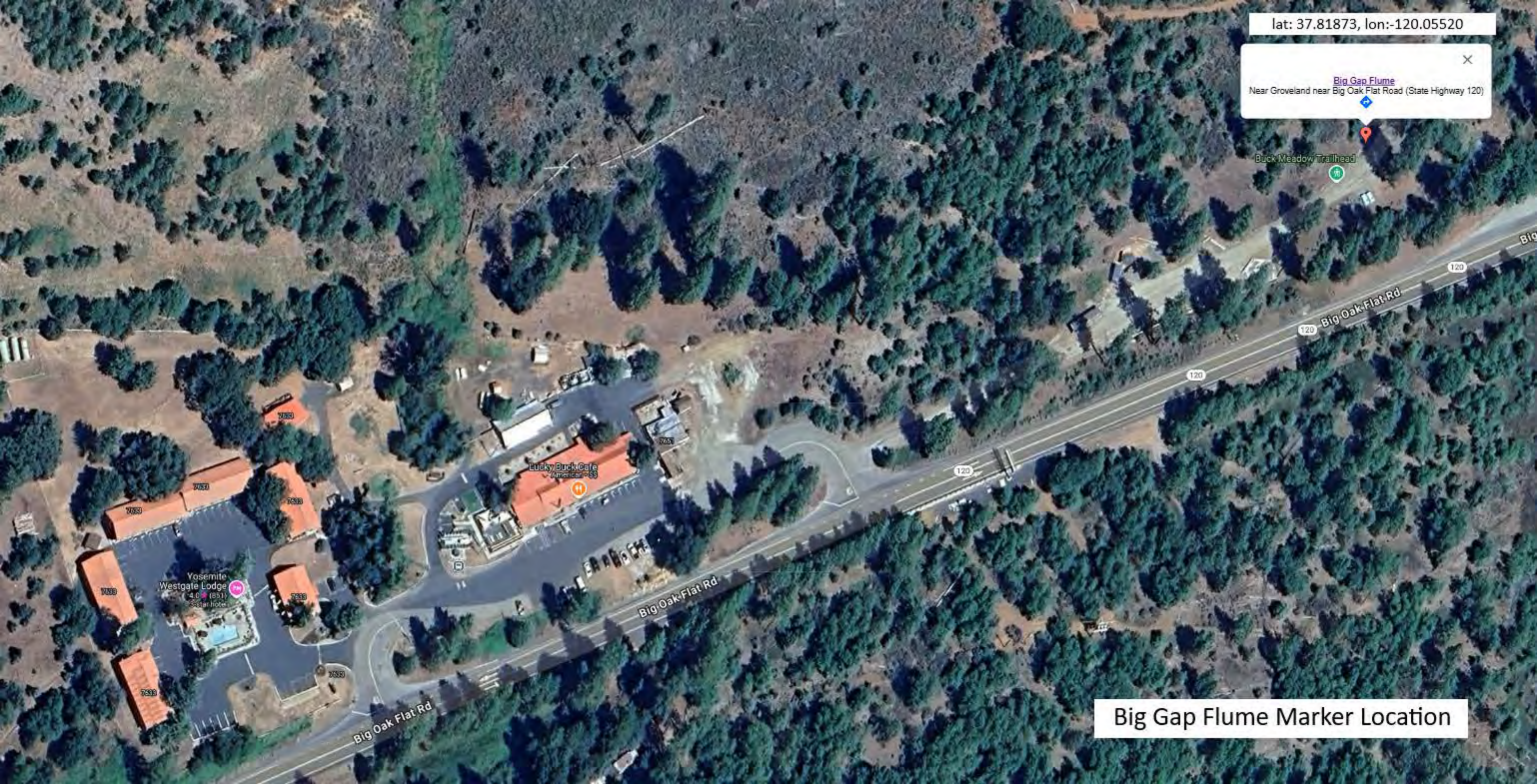
Big Gap Flume Marker Location