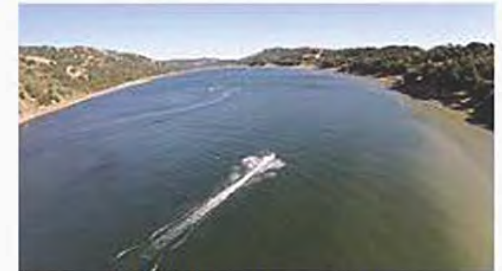
Aerial view, May 2014