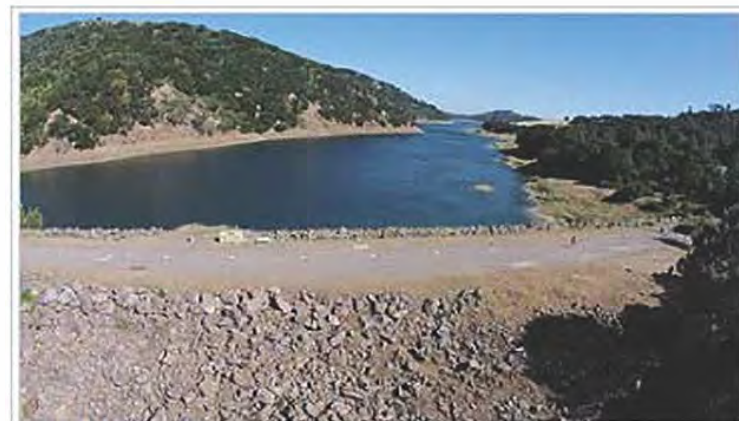
Aerial view of Coyote Dam