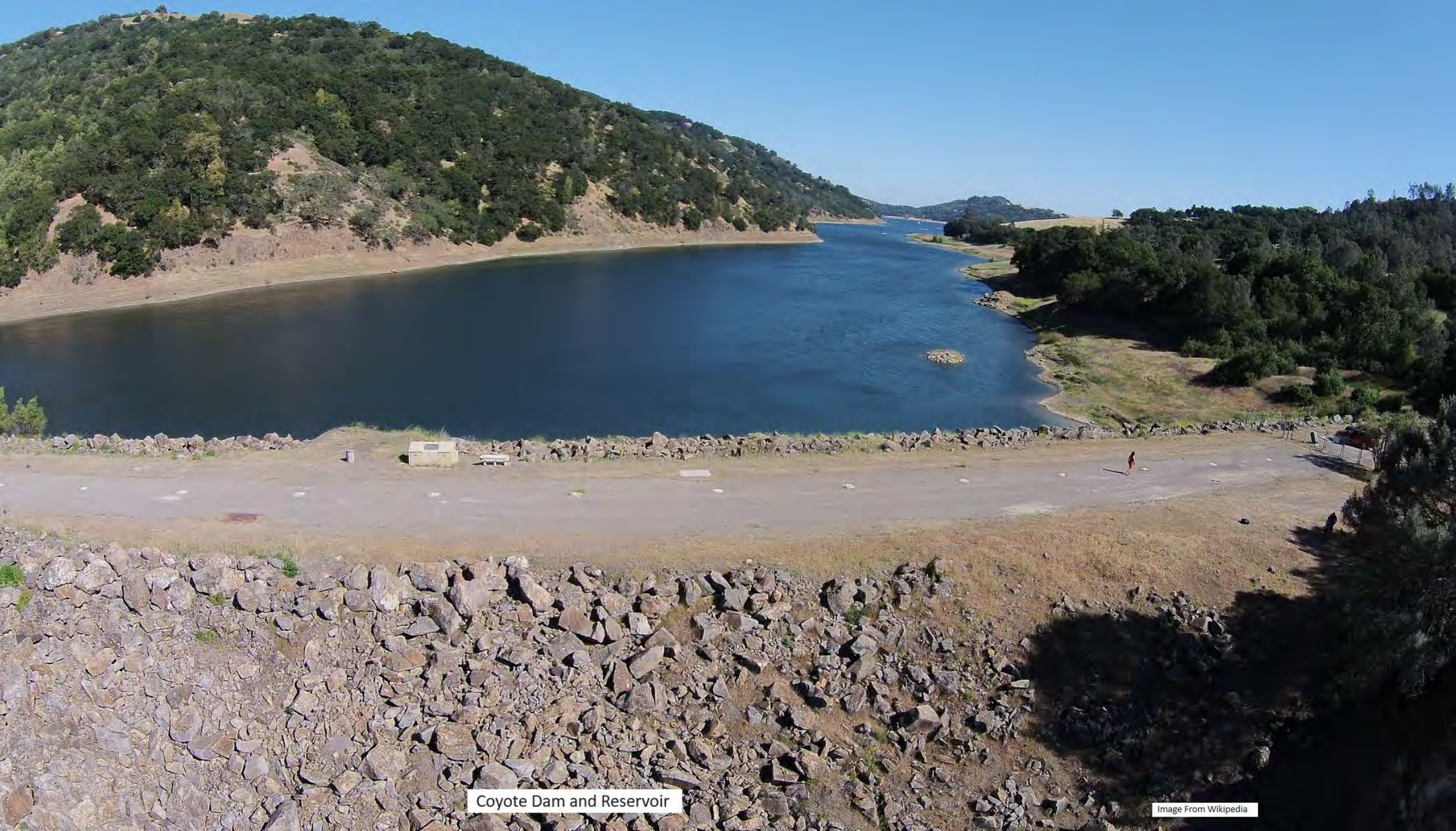
Coyote Dam and Reservoir